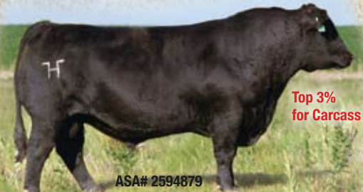
RCBF Beef Maker 102Y