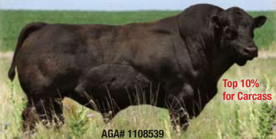
Flying H Professor 22W