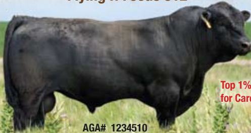
Flying H Focus 31Z