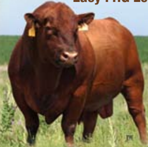
Lacy FHG Legacy 6097