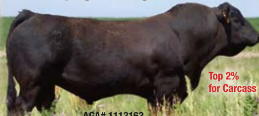
Flying H Protégé 15W